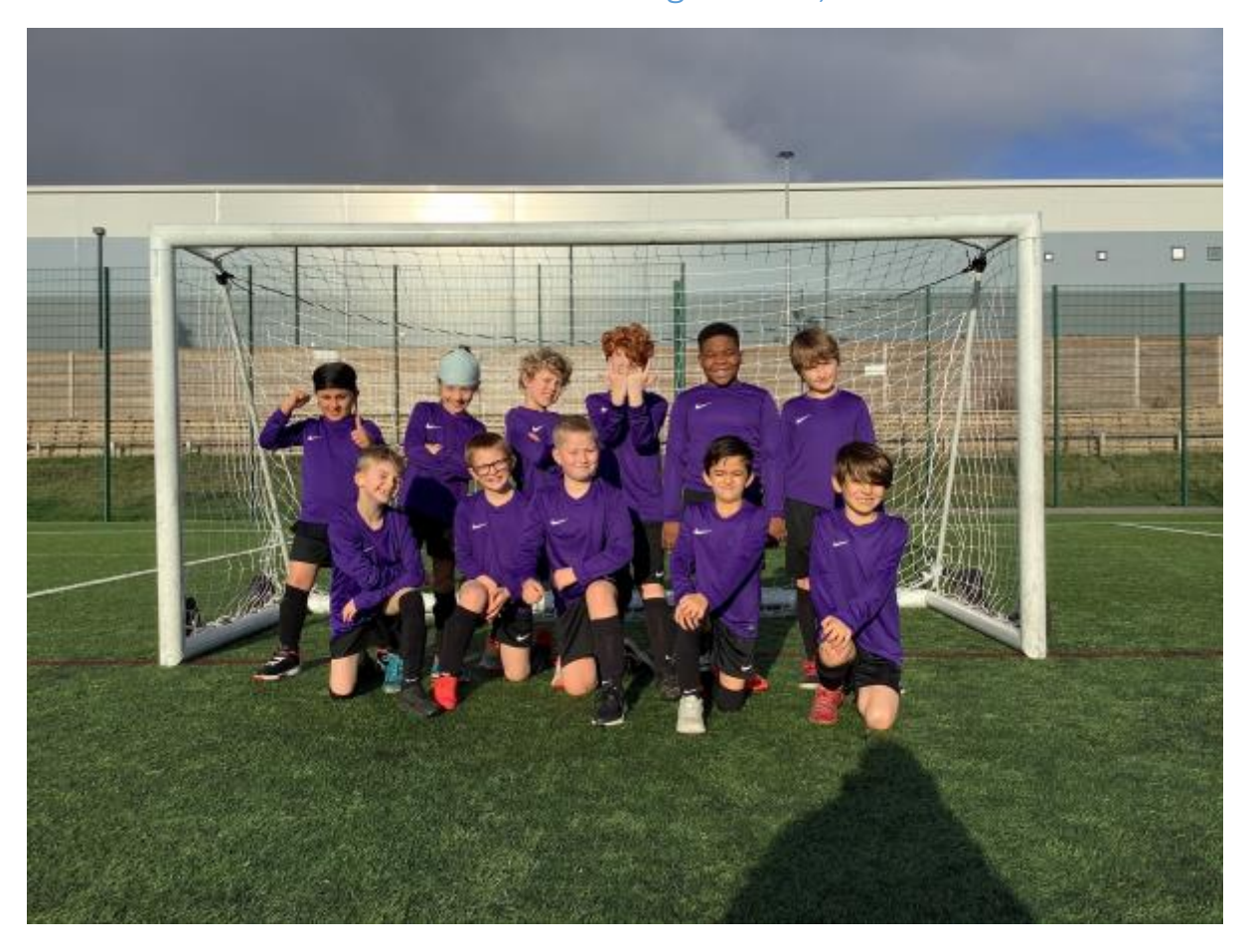
Year 4 football tournament at St George's Park, Graves

Well done to all the boys who took part in the football tournament on Tuesday 9th November. Each boy represented the school impeccably and we will definitely be looking to have more events in the future.